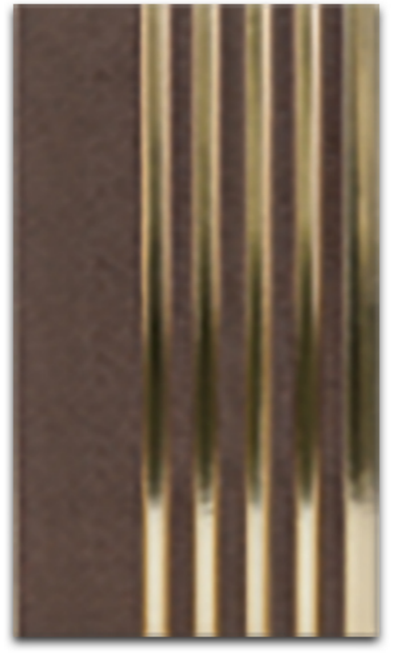
CP - V1 - 004