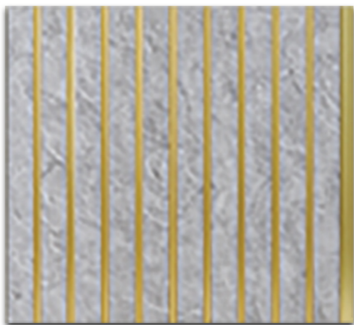
CP - V1 - 009