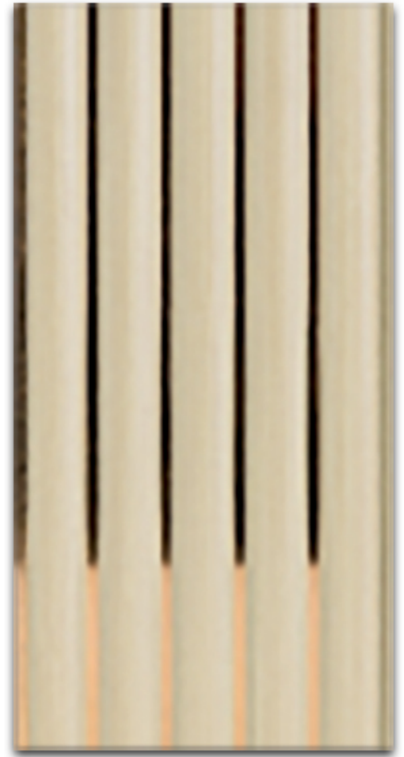
CP - V1 - 006