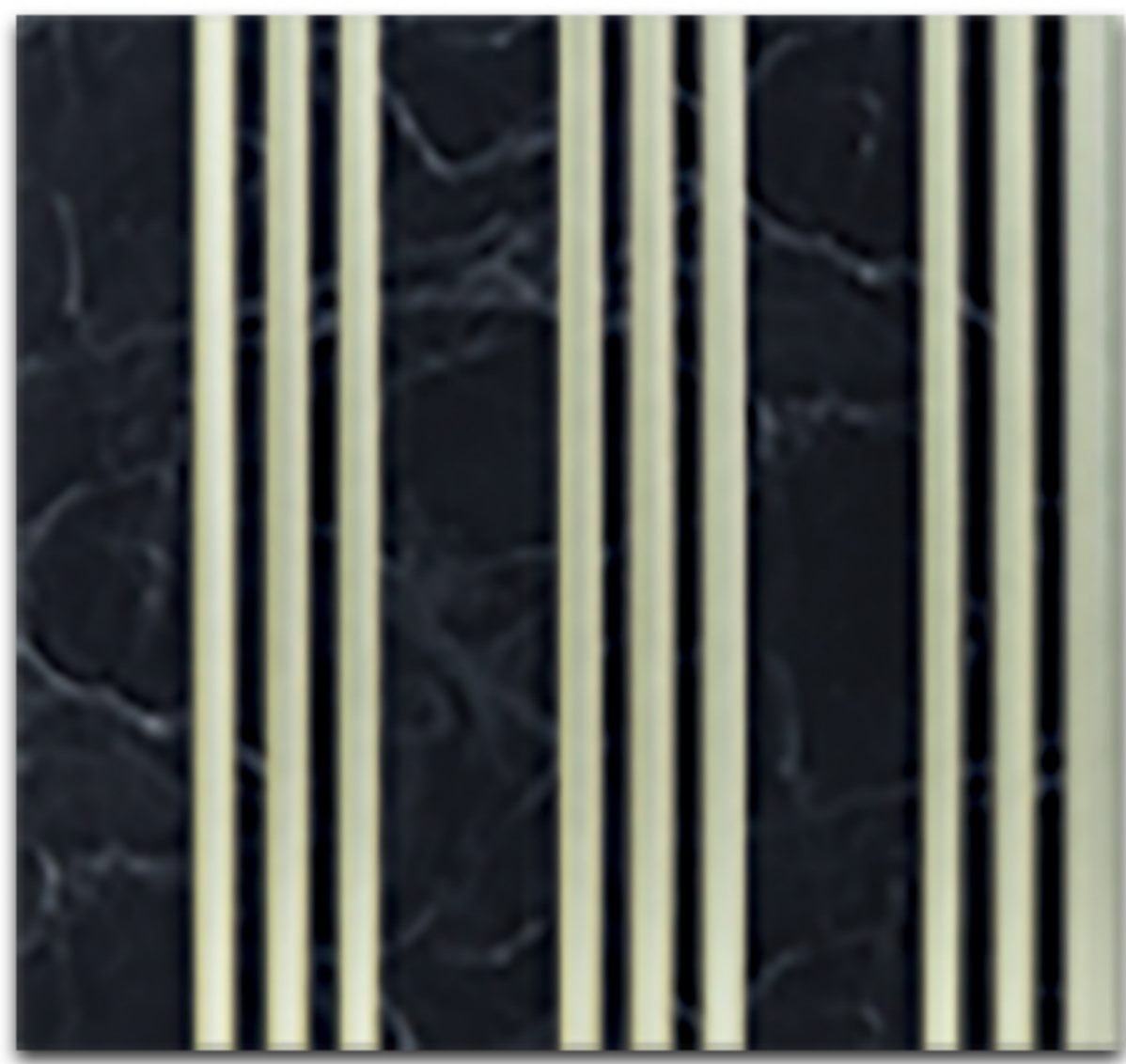
CP - V1 - 007