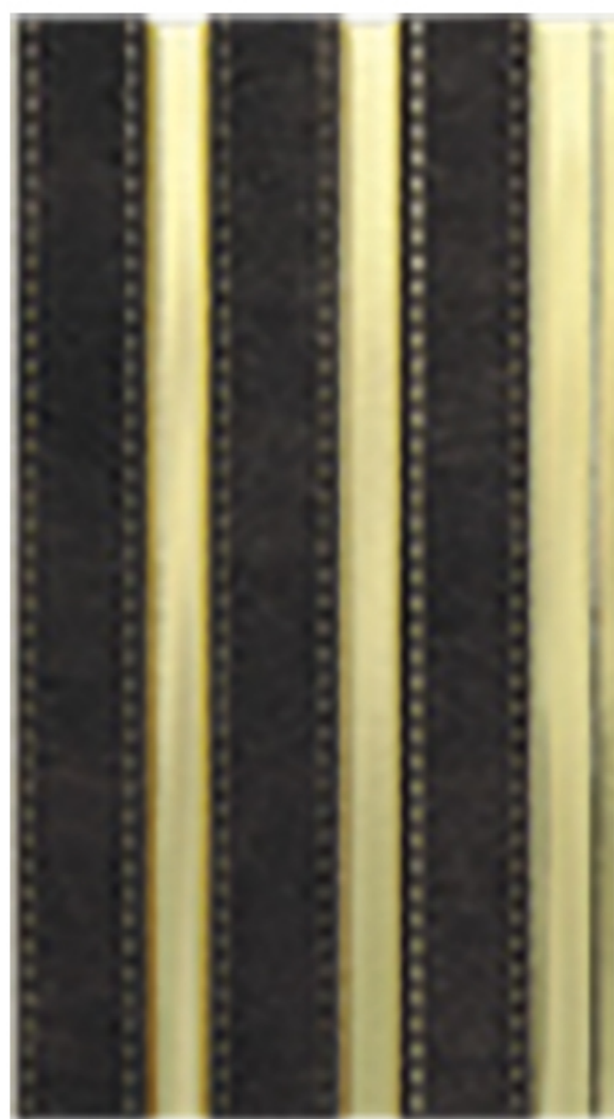
CP - V1 - 001