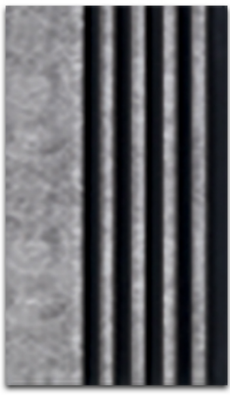
CP - V1 - 003