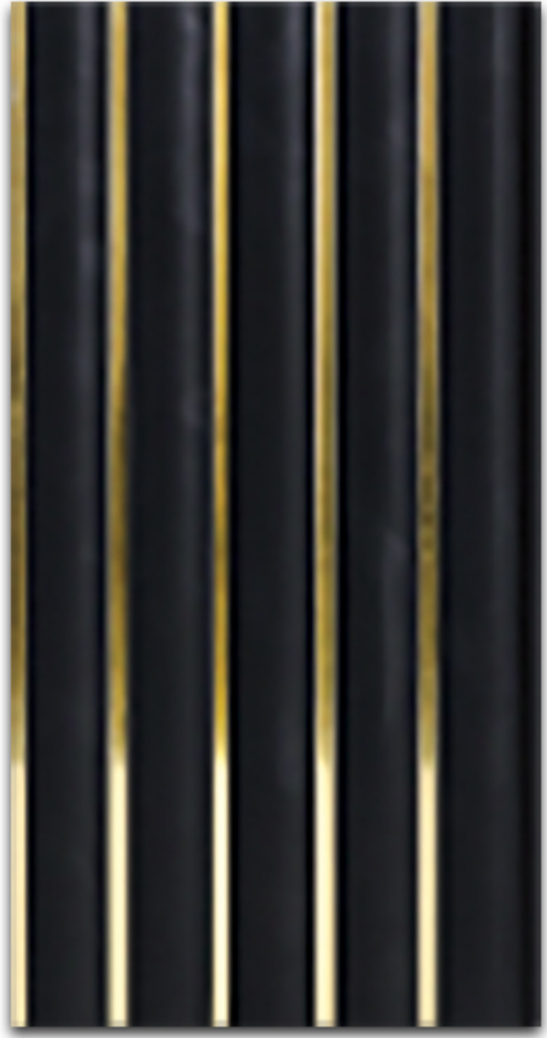
CP - V1 - 005